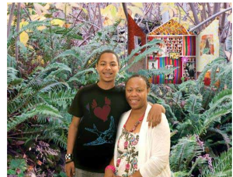
100 Families Alameda County: Art & Social Change brings together diverse, intergenerational families to create art together while strengthening the health of families and communities. Images show family members and neighbors, their completed artworks, and sections of the Highland Hospital community mural.